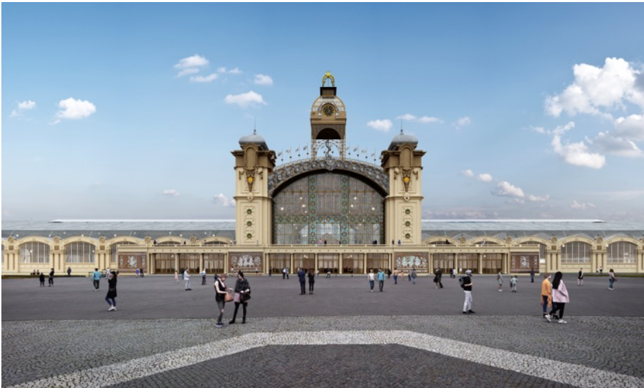
Visualization of Industrial Palace after renovation.

PQ 2027 moves back to its original location: Prague Exhibition Grounds.